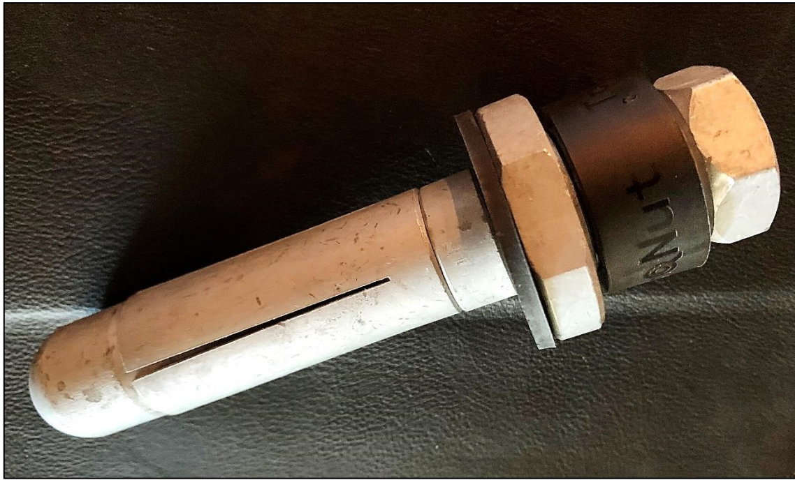
Figure 1: Photograph of the client supplied M20 blind bolt assembly with a M20 Torqnut prior to installation and testing. (client supplied photo)

CONFIDENTIALITY: The information contained in this report is confidential property of our client and is intended solely for the use of the named recipient(s). The information and statements in this report are derived from and related only to the material tested. This report shall not be reproduced except in full without written approval of Metallurgical Technologies, Inc.